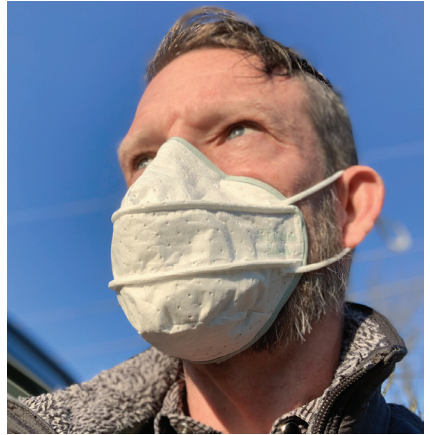
*Silicone Tensioning Button

Disclaimer- Not suitable for dusty environments. Intended for general use. Not a medical device, not an occupational mask. Some people may find our mask too restrictive to wear during vigorous exercise.